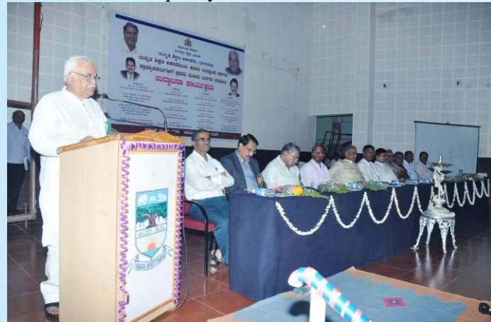
ನ್ಯಾಕ್ ಮೌಲ್ಯಮಾಪನ ಮತ್ತು ಮರುಮೌಲ್ಯಮಾಪನ (ಒಂಅ). ಕಾರ್ಯಾಗಾರ, 15/6/2015.

sessions on the first day of training; the topics included 1.Preparation and Submission of LOI & IEQA, 2. NAAC Process and Preparation of SSR, 3. The Role of IQAC and sustenance of quality.